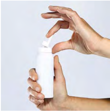
Figure A: Break tiny plastic piece on Olux-E Foam can nozzle.

2. Shake the Olux-E Foam can before use.