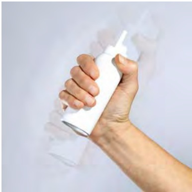
Figure B: Shake Olux-E Foam can.

2. Shake the Olux-E Foam can before use.