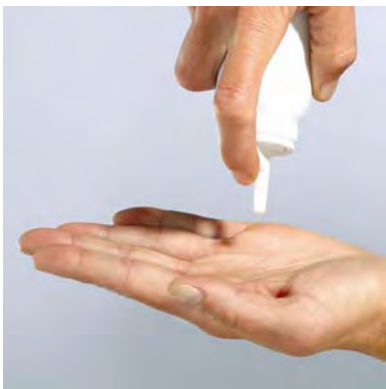
Figure C: Turn Olux-E Foam can upside down and press nozzle.

3. Turn the Olux-E Foam can upside down and press the nozzle. See Figure C.