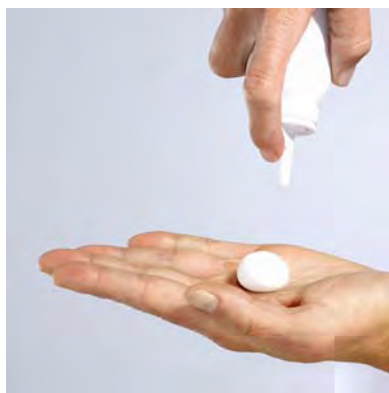
Figure D: Dispense Olux-E Foam into hand.

5. Use enough Olux-E Foam to cover the affected area with a thin layer. Gently rub the foam into affected area until it disappears into the skin.